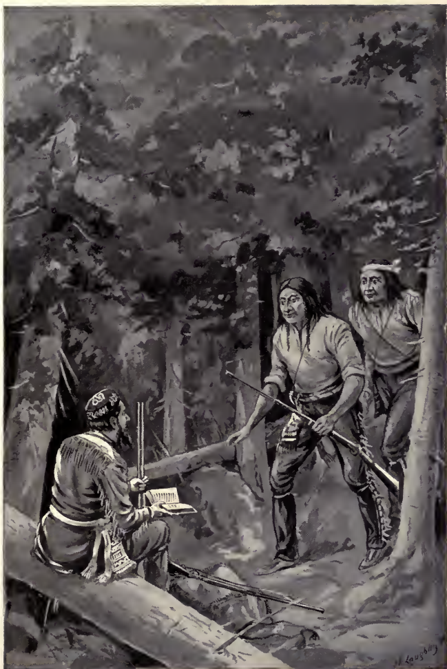
"GOOD MISSIONARY, BUT HIM LOST THE TRAIL."